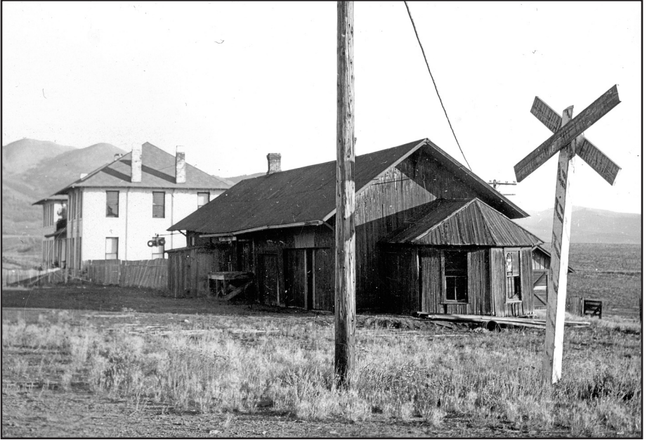
The “track side” of the Como depot and hotel as it was on September 25, 1940.