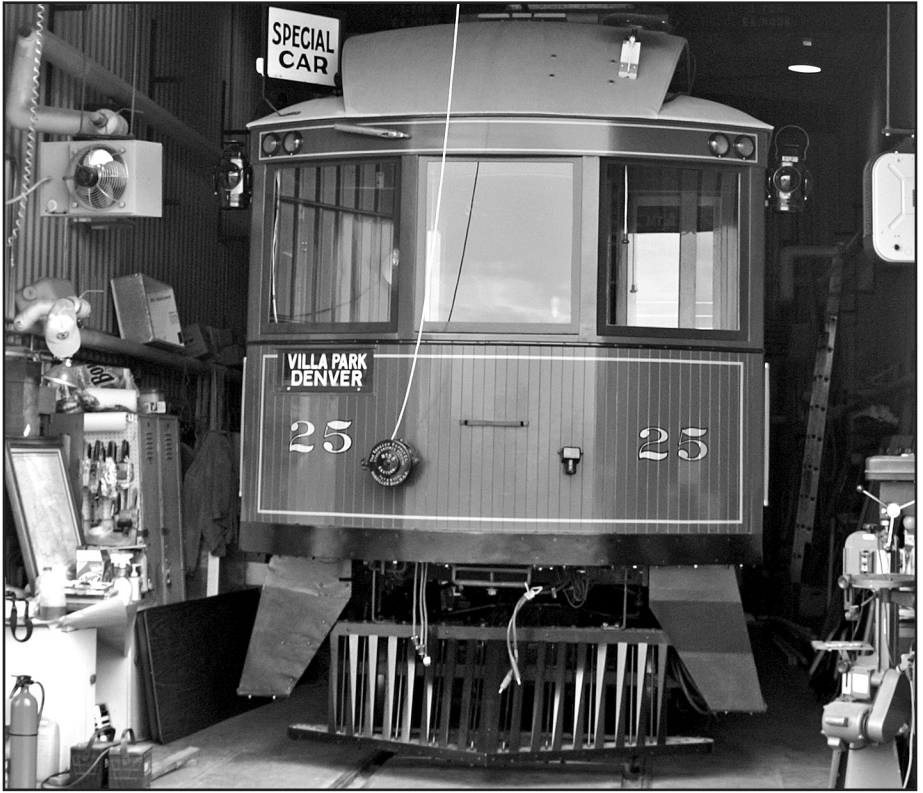
No. 25 in the "Car Barn" at the Denver Federal Center.

ing this magnificent piece of equipment restored, completely, will be a very exciting anniversary celebration. To have gotten this far would not have been possible without your steady financial support along with matching donations from employers such as Xcel Energy, US West (Qwest) and the grant from the Union Pacific. Unfortunately, the program guidelines of some companies such as Union Pacific have changed to not include our requests. This makes your individual donations even more important to our restoration endeavor.