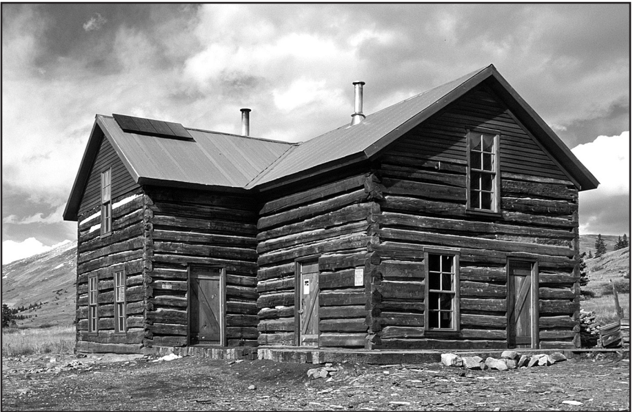
The Boreas Pass section house in October 1998.