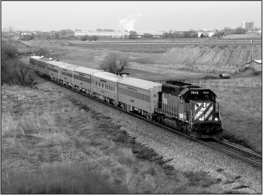
The seven car BNSF Officer Special eastbound at Tonville, Colorado.