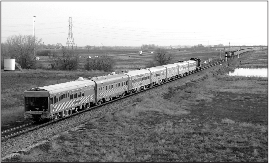
Track inspection theatre lounge car WILLIAM B. STRONG trails the BNSF Officer Special at Tonville, Colorado, as the train approaches a westbound coal train in the siding.